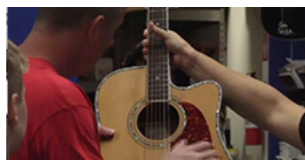
Guitar Sales & Repairs